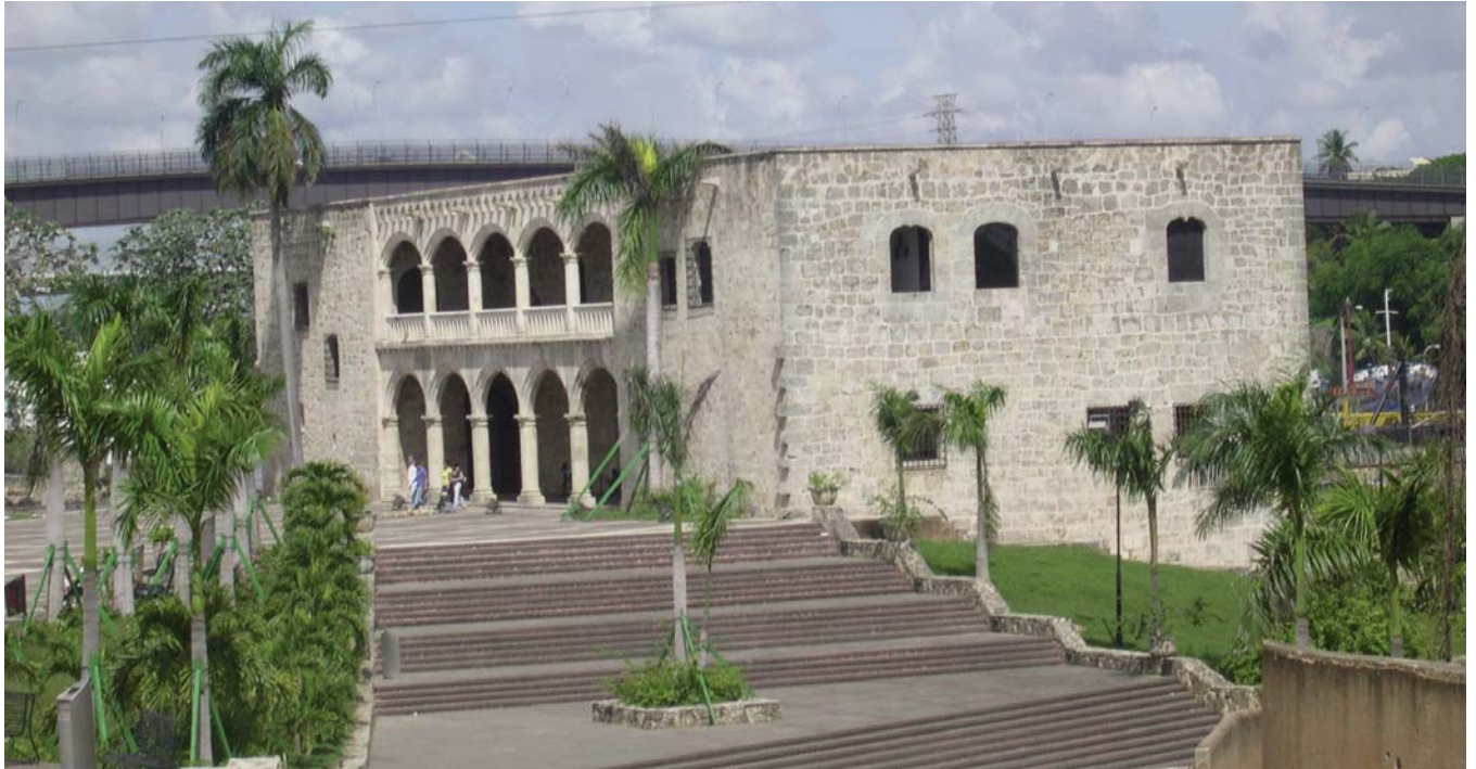
Alcázar de Colón or Columbus Alcazar