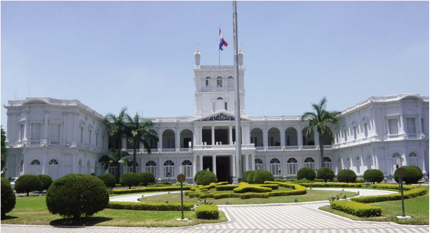
Palace of the López