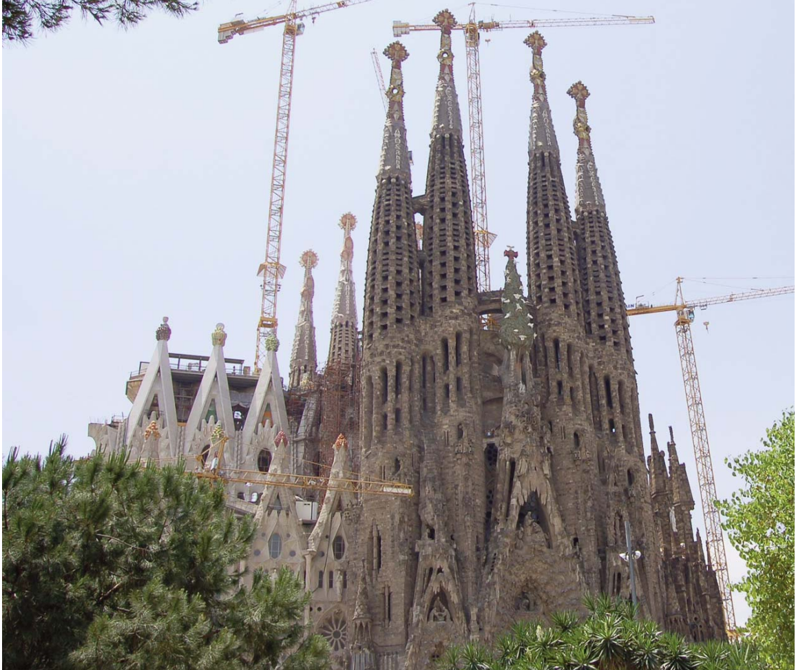
Expiatory temple of the Holy Family or Sagrada Familia in Barcelona