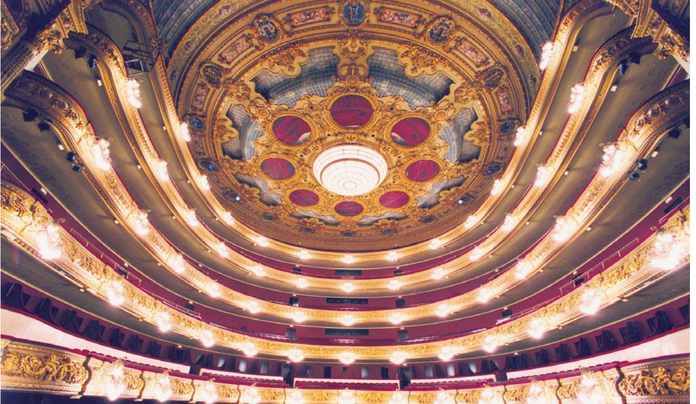
The Great Lyceum Theatre