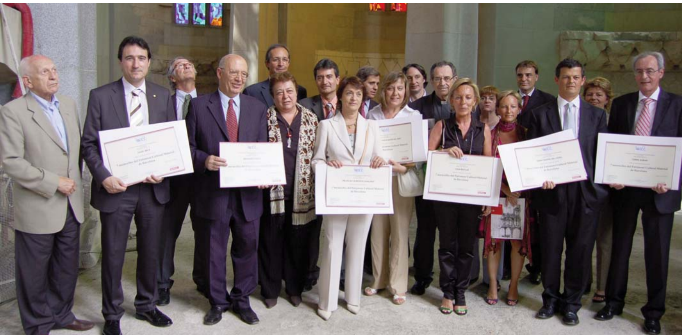
Ceremony of awarding the diplomas to the representatives of the treasures of Barcelona, an act held inside the Expiatory Temple of Sagrada Familia, in the presence of the current mayor of Barcelona, Xavier Trias, and several councillors of the Barcelona City Council