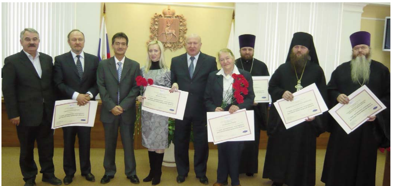
Ceremony of awarding the diplomas to the representatives of the treasures of Nizhny Novgorod, in presence of the Governor of this Russian Region, Valery Shantsev. The act took place in the hall of the Council of Ministers of the Nizhny Novgorod government