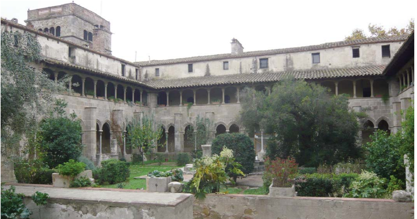
Monastery of St. Jerome of Murtra