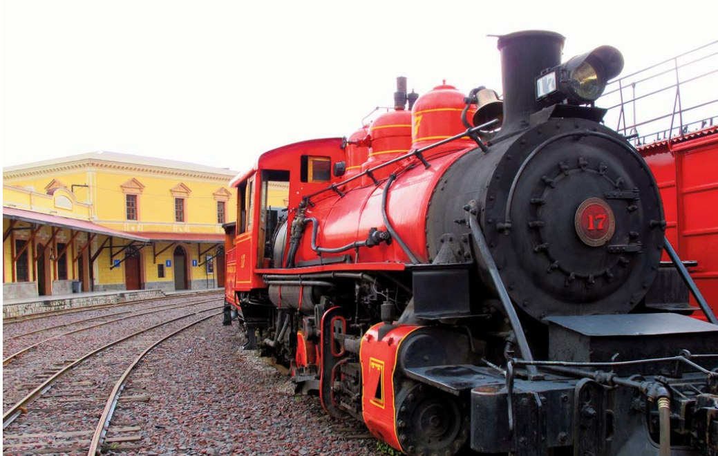
Railway Station Eloy Alfaro of Chimbacalle