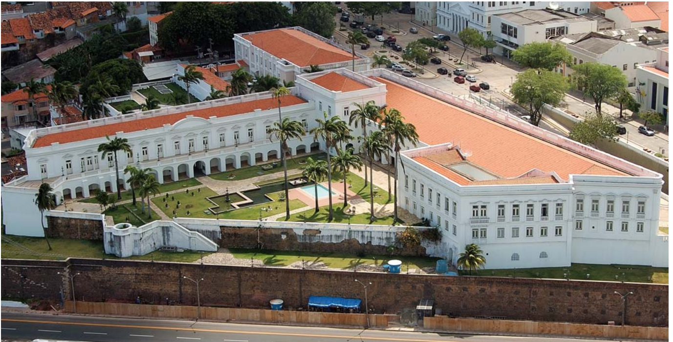
Palace of the Lions