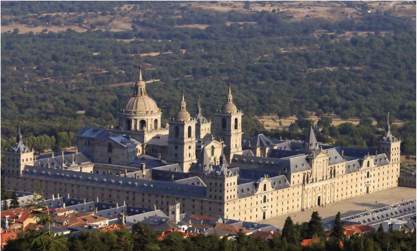
Monastery and Royal Residence of San Lorenzo del Escorial