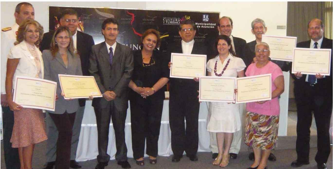
Act of awarding accreditation diplomas to the representatives of the 7 Treasures of the Cultural Heritage of Asunción, chaired by the Intendant (Mayor) of Asunción, María Evangelista Troche de Gallegos, Director General of Culture and Tourism of the Municipality of Asunción, Fernando Pistilli, and the Deputy Minister for Cult of the Paraguay's Education and Culture Ministry, Hugo Brítez