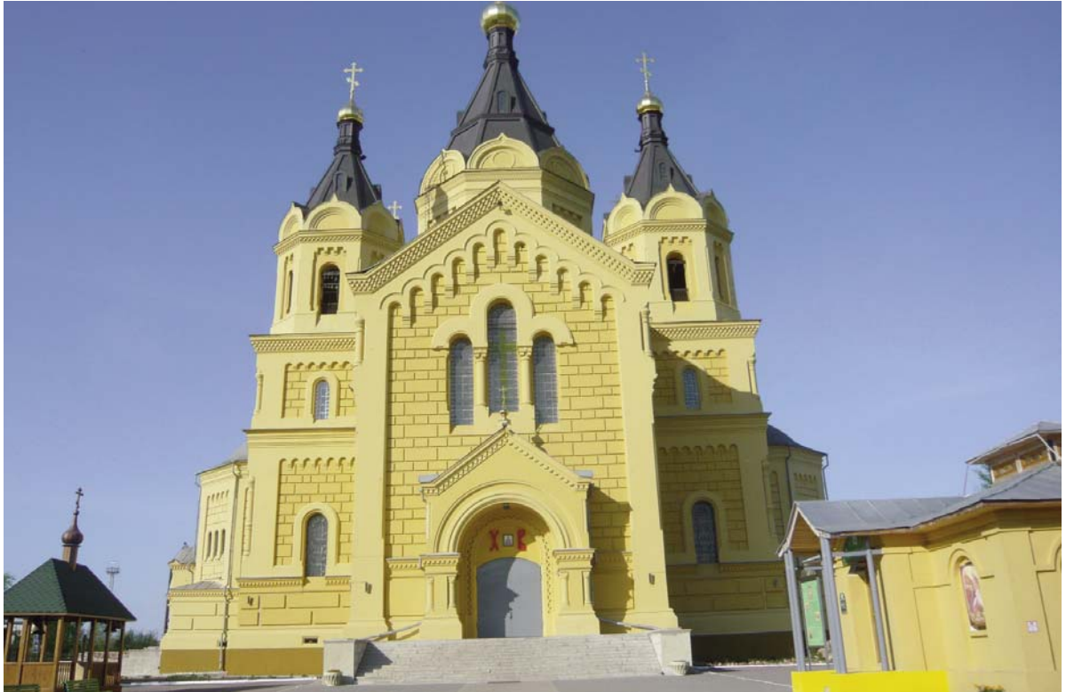
St. Alexander Nevsky's Cathedral