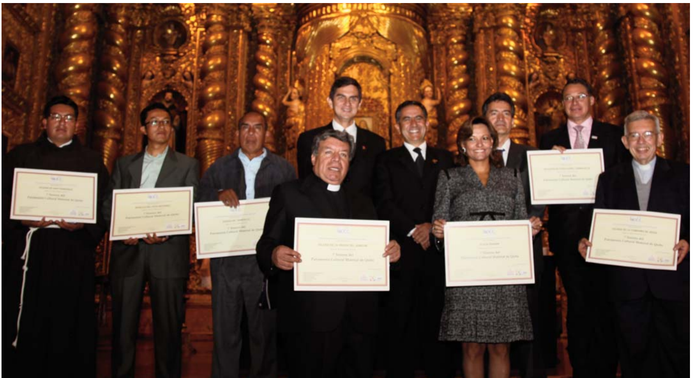
Augusto Barrera, Mayor of the Metropolitan District of Quito, and Xavier Tudela, President of the International Bureau of Cultural Capitals, with the representatives of the items chosen as Treasures of the Cultural Heritage of Quito. The ceremony took place in the Church of the Society of Jesus