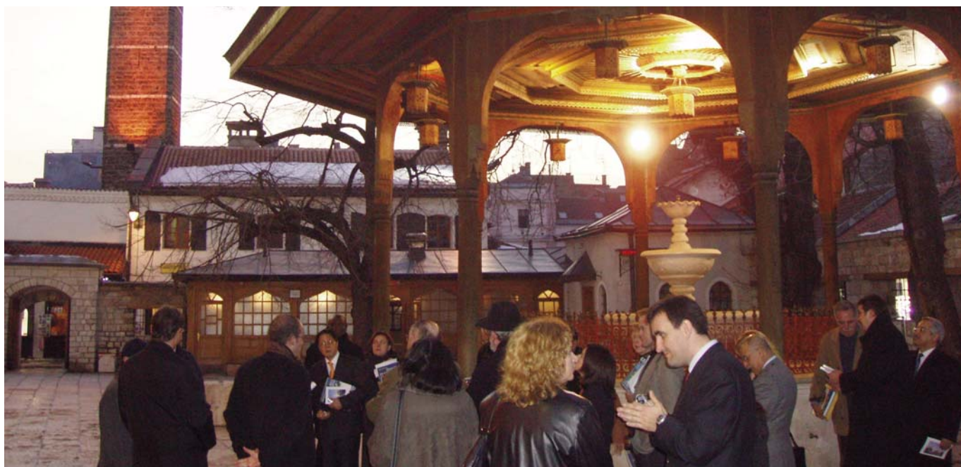
Old Town of Sarajevo (Bascarsija)