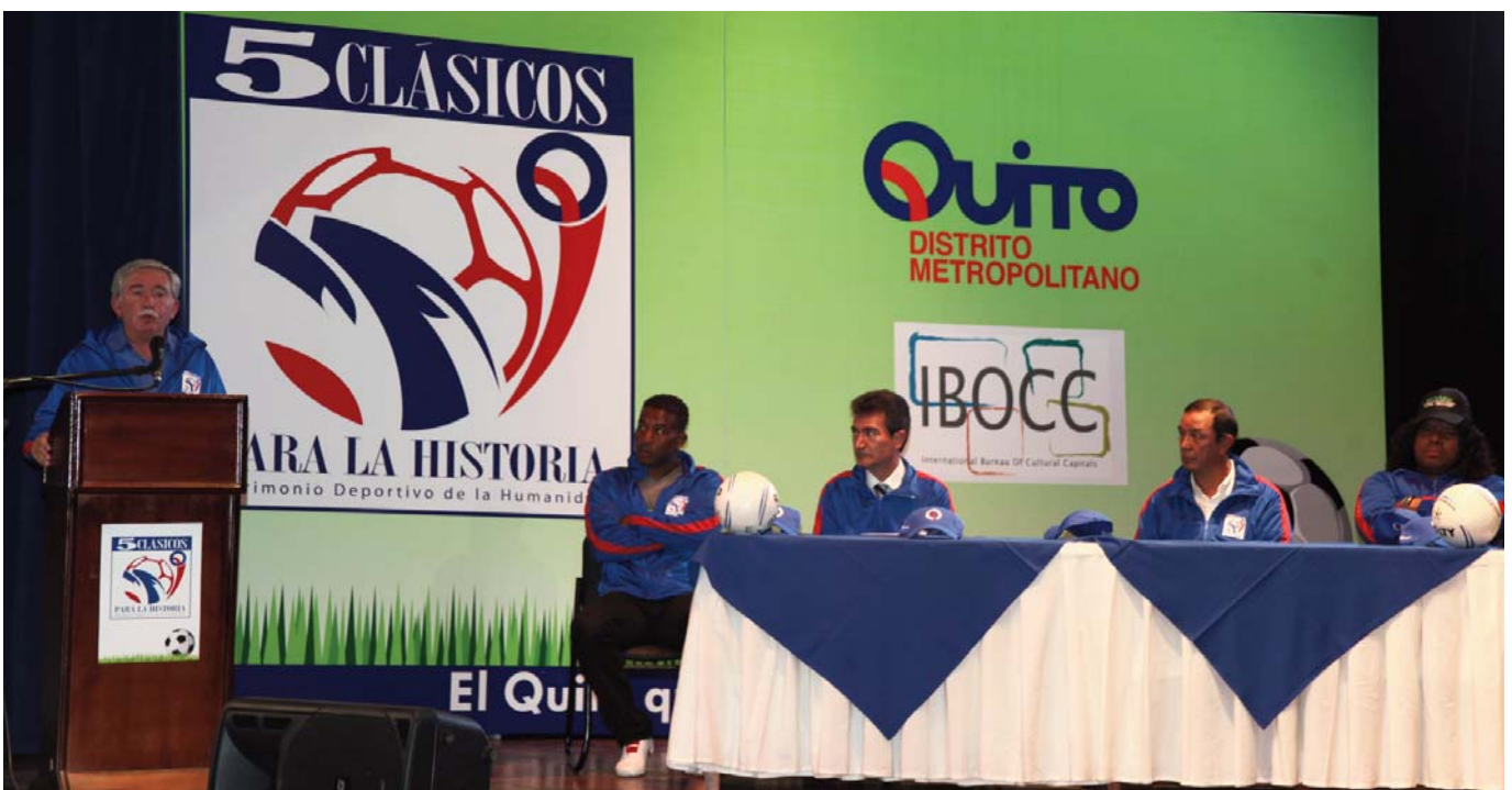
Announcement of the campaign 5 Football Matches Played in Quito Historical Sports Heritage of Humanity , on February 17, 2012.

Those wishing to submit proposals for candidate matches should be identified with their full name, mail address, e-mail and telephone.