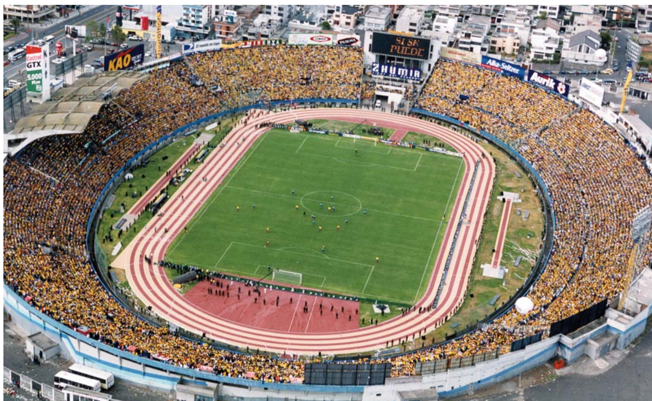
Atahualpa Olympic Stadium, where, among others, the Deportivo Quito Team, the National Team and Ecuadorian National Football Team play.

Quito was the first city in the world to incorporate elements of its Material Cultural Heritage into the Unesco World Heritage List. It will also be the first city in the world to incorporate its 5 football matches Historical Sports Heritage of Humanity into the Sports Heritage List of the International Bureau of Cultural Capitals.