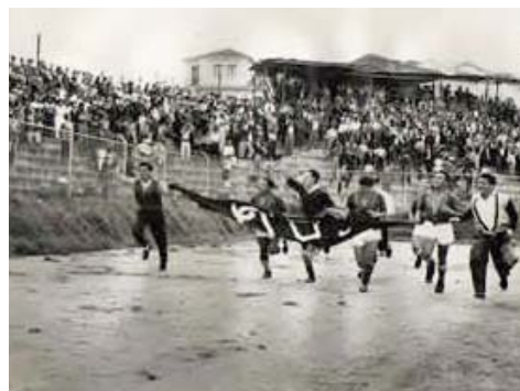
Historical images of the El Ejido Stadium, also popularly known as "El Arbolito (The Little Tree)" (1932-1966) the city's oldest, most legendary and traditional.