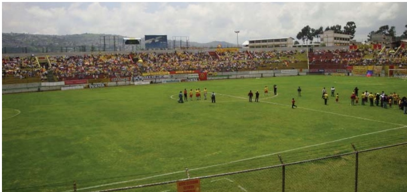
The Gonzalo Pozo Stadium where the Sociedad Deportiva Aucas plays.

Its official uniform is yellow shirt holder with red details, red shorts, grey socks.