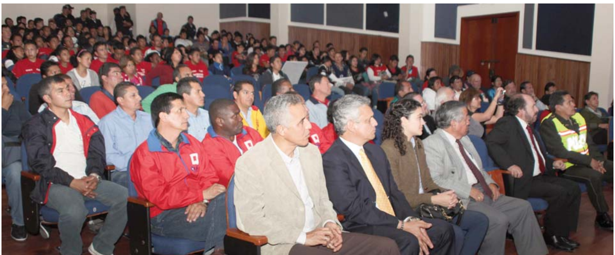
Announcement of the campaign of 5 football matches played in Quito Historical Sports Heritage of Humanity aroused great.

International promotion of the 5 football matches played in Quito Historical Sports Heritage of Humanity .