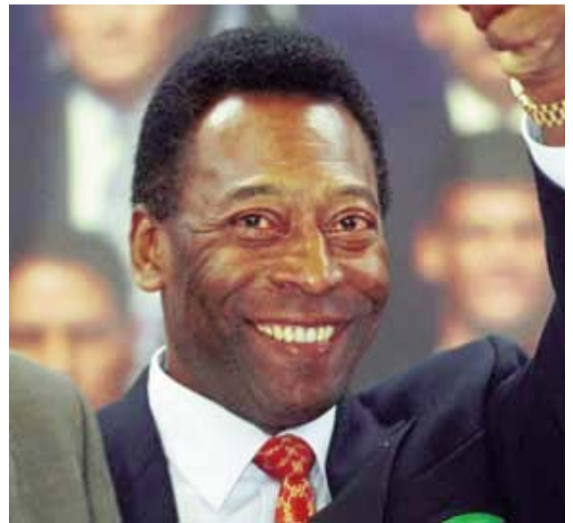
Edson Arantes do Nascimento "Pelé"