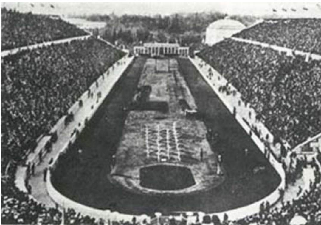
Athens Olympic Games 1896.

This Representative List of Historical Sports Heritage of Humanity , with characteristics similar to those that already exist in the areas of cultural material, intangible or natural heritage of Humanity, seeks to promote the consolidation of the importance of preserving the sports reality worldwide. The first sport to be added to this List will be football.