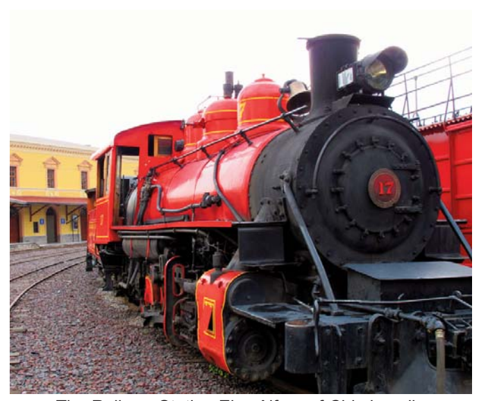
The Railway Station Eloy Alfaro of Chimbacalle