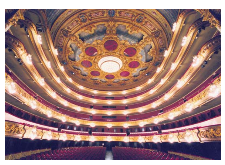
Liceu Great Theater