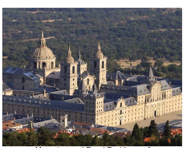
Monastery and Royal Residence of San Lorenzo del Escorial