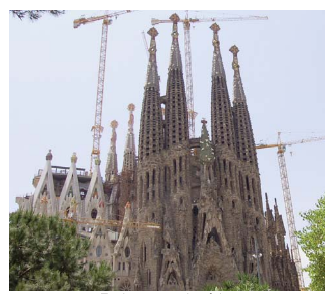
Expiatory temple of the Holy Family or Sagrada Familia in Barcelona