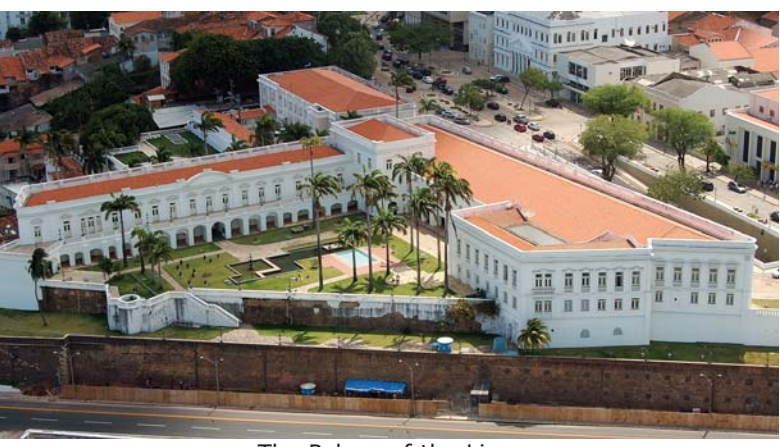
The Palace of the Lions