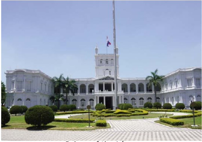
Palace of the López