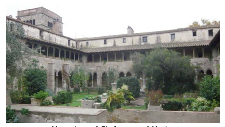
Monastery of St. Jerome of Murtra