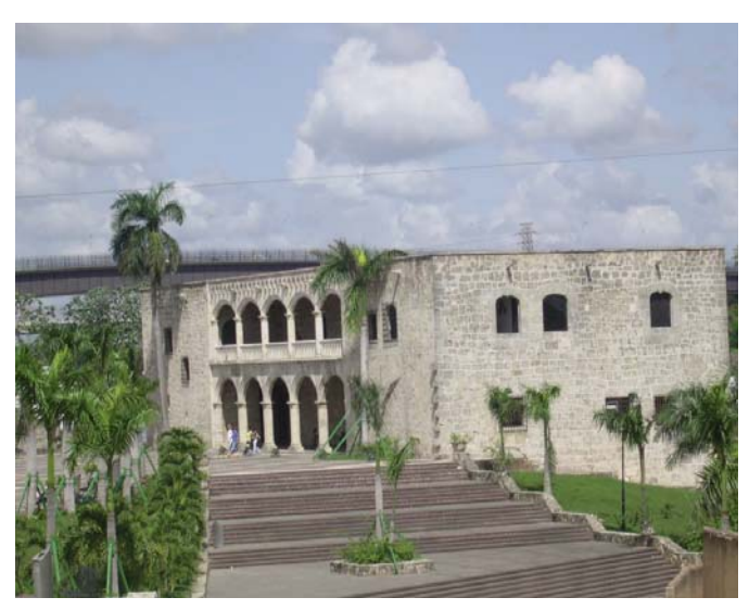
The Alcázar de Colón or Columbus Alcazar