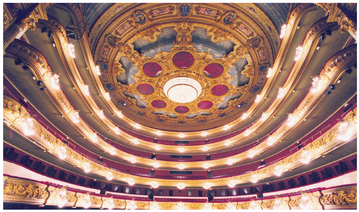
The Great Lyceum Theatre