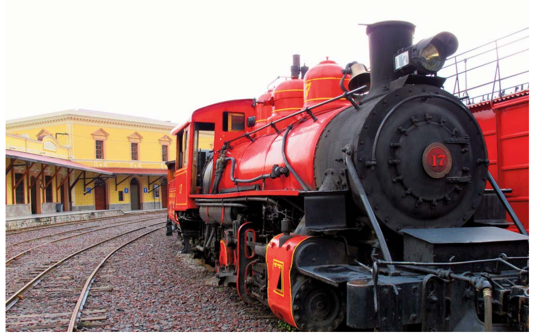
Railway Station Eloy Alfaro of Chimbacalle