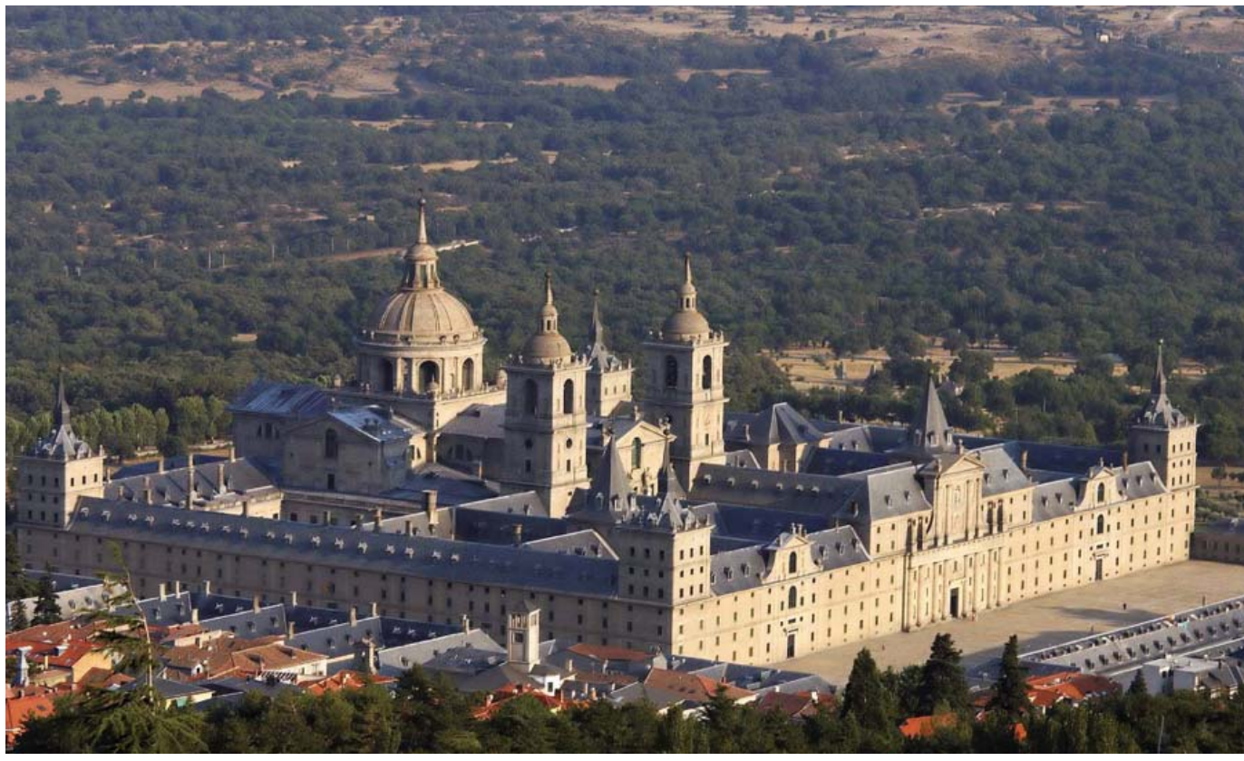
Monastery and Royal Residence of San Lorenzo del Escorial