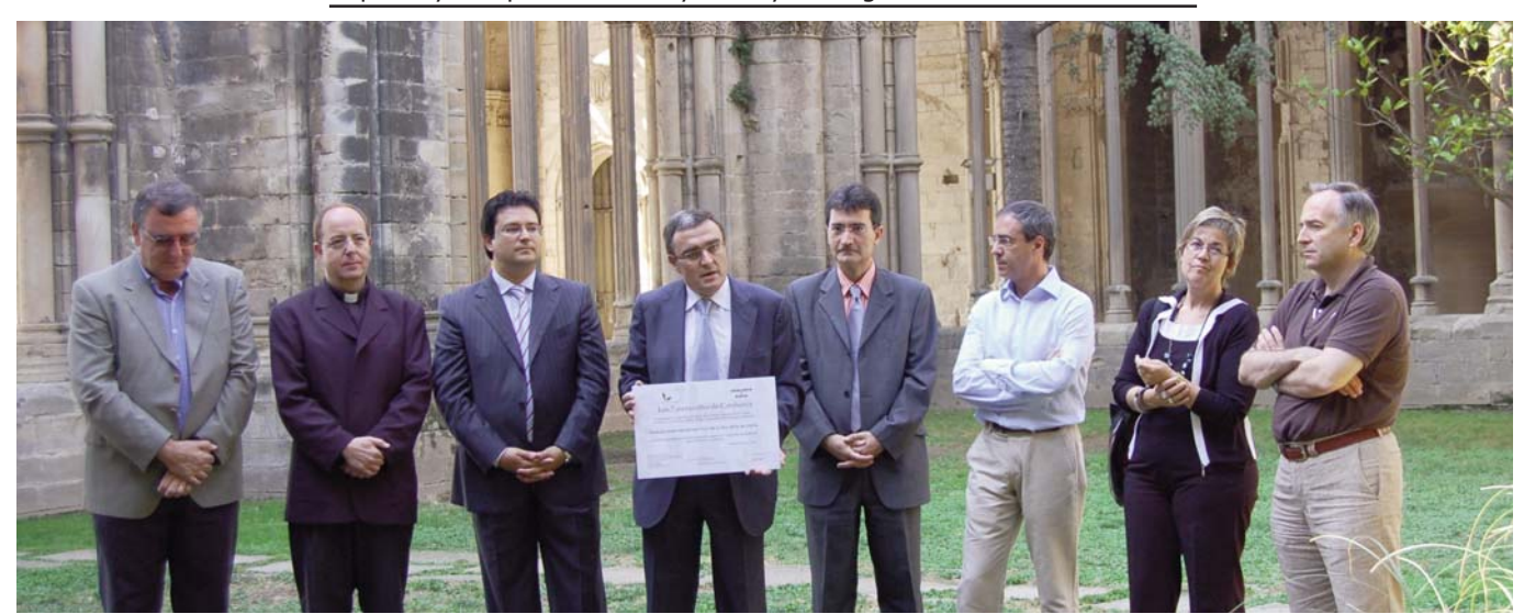
Ceremony of awarding the diploma to the Monumental Ensemble of the Old Cathedral Hill of Lleida, in the presence of the City Mayor, Àngel Ros, and other authorities