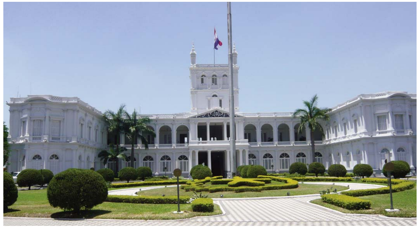
Palace of the López