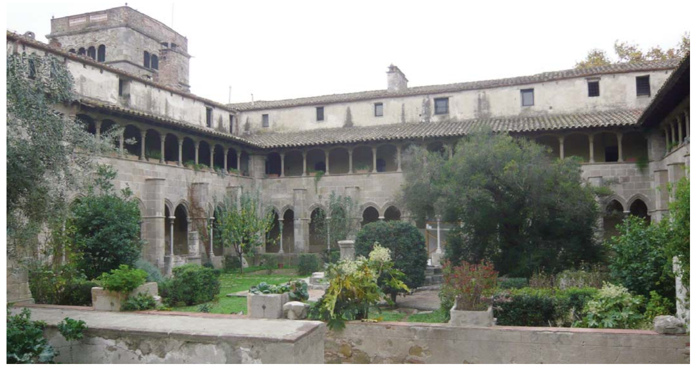
Monastery of St. Jerome of Murtra