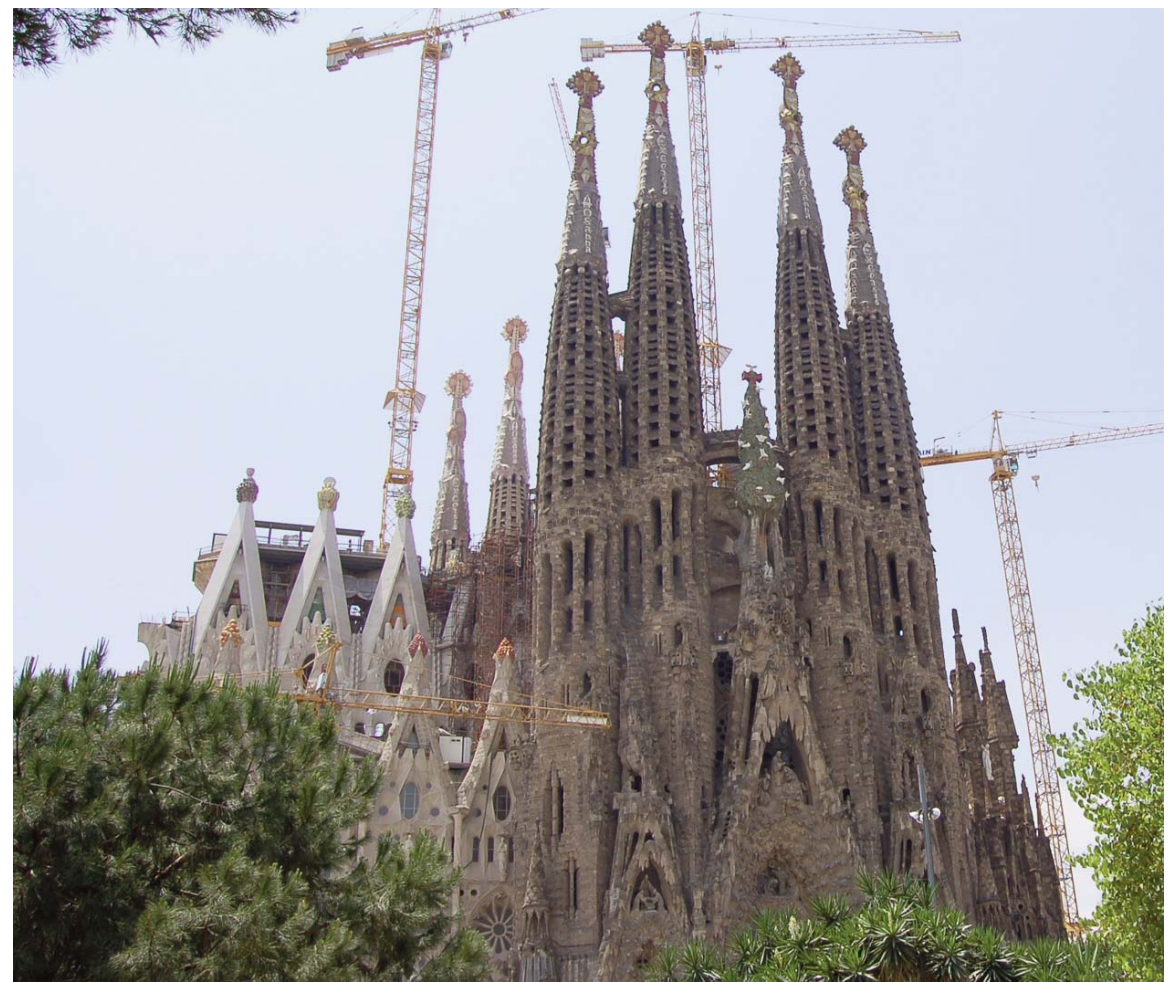
Expiatory temple of the Holy Family or Sagrada Familia in Barcelona